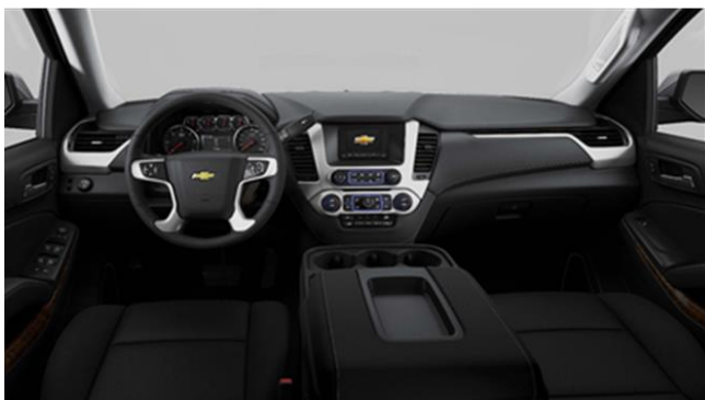
Black / Black – H0U