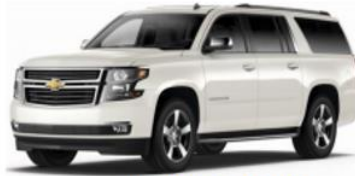
Ivory White (G1W)