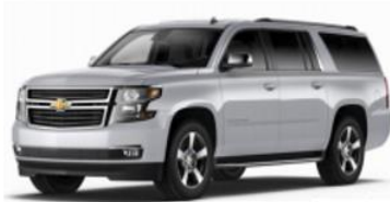
Bright Silver Metallic (GAN)