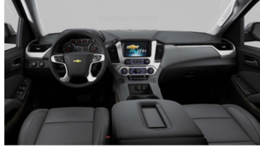
Black / Dark gray – H2V