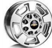
17" aluminum (PZX)