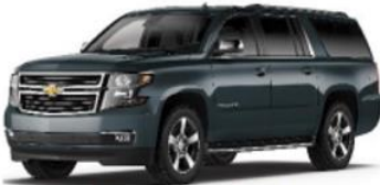
Sapphire Blue Metallic (G1M)