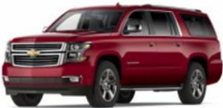
Red Tint Metallic (G1E)