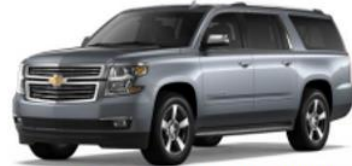
Steel Gray Metallic (G9K)