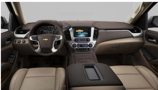
Cocoa / Dune – H2Y