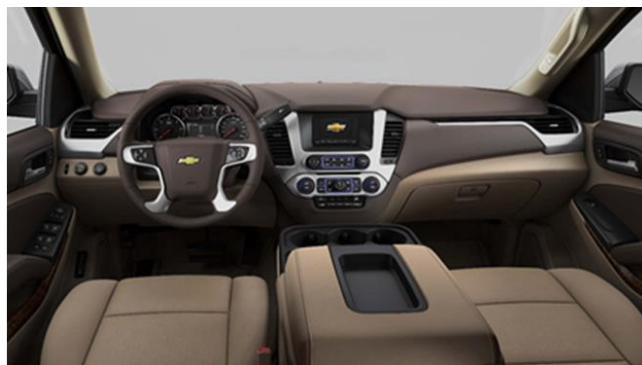
Cocoa / Dune – H2T