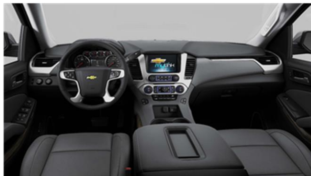
Black / Dark gray – H2V