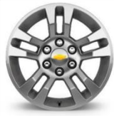
18" aluminum (PZX)