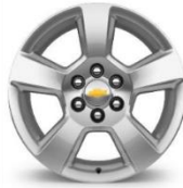
20" aluminum (PZX)