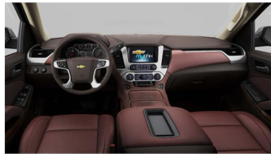
Cocoa / Cinnamon – H4X